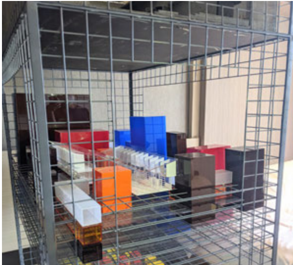
OPENUU's Growing Bridges manifest a variety of shapes and sizes within their shared programmatic purpose to connect programs across open space.

The upper section of the composition completes its progression from large to small scales with .via's focus on pixilated architectural features. The column capital is a textured structure referring to a lantern wall to celebrate heritage and traditions of the Chinese vernacular courtyard house. via's segment extracts the configuration of the lantern wall from a related project defined by brick-clad pavilions surrounding a central pool, with inward and outward views. Visitors experience interior and exterior environments within the column capital as a reinterpretation of a culturally significant spatial pattern. The composition is therefore not only the architectural premise of fusing together elements of nature, vernacular architecture and